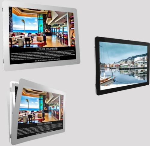
SLIMLINE 10mm thick